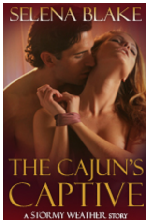
The Cajun's Captive