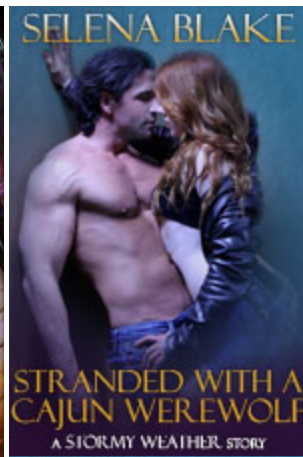
Stranded with a Cajun Werewolf