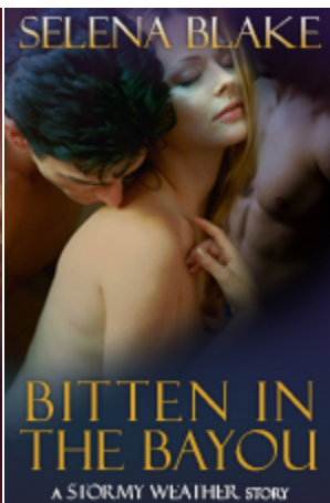
Bitten in the Bayou