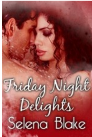
Friday Night Delights Free Read