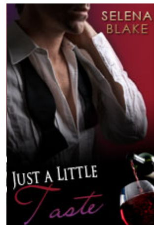
Just a Little Taste